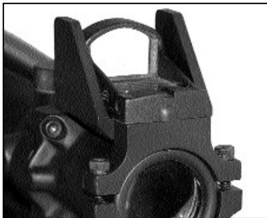
Microelectronic reflex sighting system for pistols, rifles or shotguns

Read this manual first, as the JPoint can be damaged by improper use or adjustment.